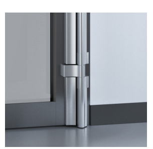
Align. Press on. Fix. Done.